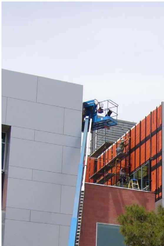
Two men and a bucket install WrapShield and VaproFlashing.