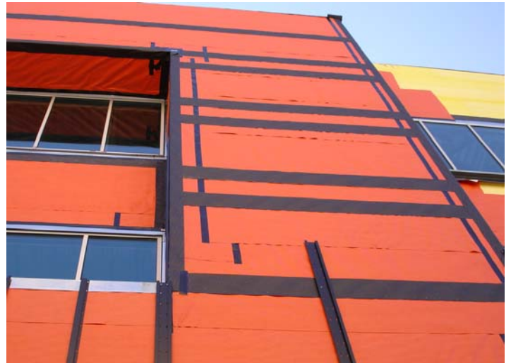
WrapShield provides consistent coverage without tears or flapping laps.