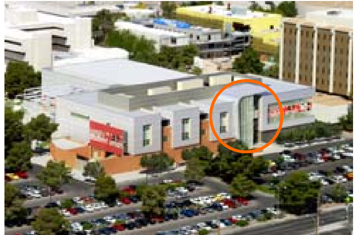
Completed in 2006 the Donald C. Moyer Student Union aerial image from the Southeast. Notice the indicated area above and the under construction image below. WrapShield (orange) with VaproFlashing (black) with secure fit and finish around windows, abutments and arch.

Since the Penta Group primarily develops hotels, casinos and condominiums, they wanted to work with a contractor experienced in institutional building. This project was a true collaboration between all groups to provide a rain screen building envelope design.